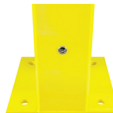
› Flush Post