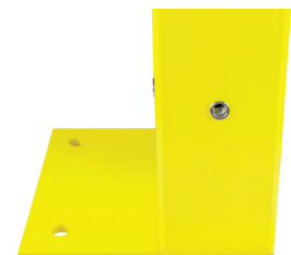
› Corner Post

Specifications subject to change without notice.