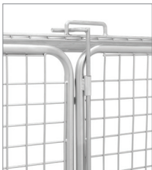
Full-length locking mechanism