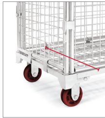
Quick clip design assembles without tools