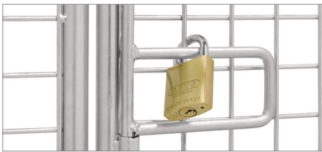
Folding latch securely closes cart (padlock not included)